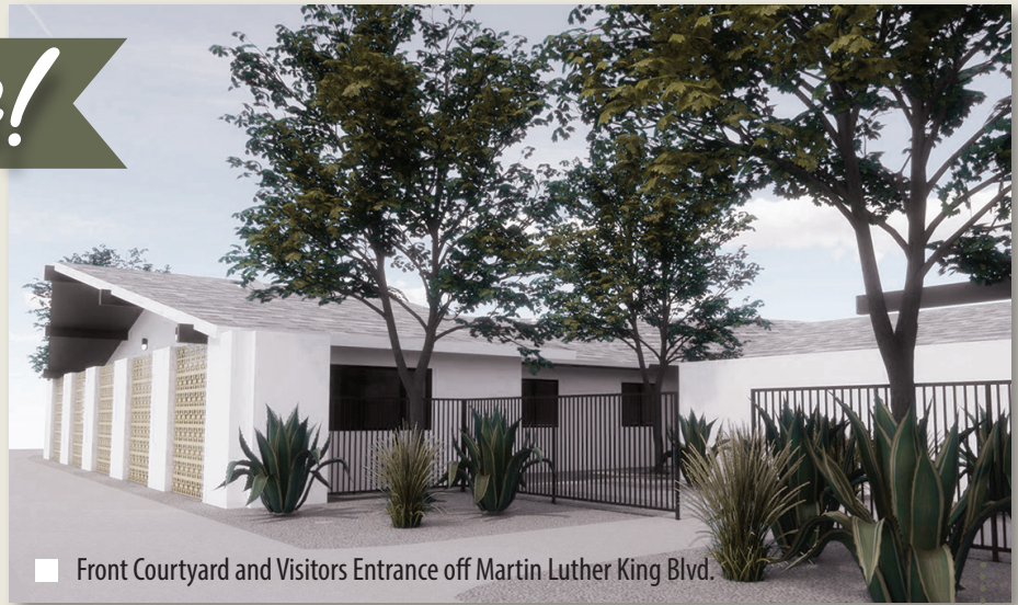
■ Front Courtyard and Visitors Entrance off Martin Luther King Blvd.

Please join us on Thursday, June 19, 2025 at 11:00 am as we breakground on a brighter future for the community!