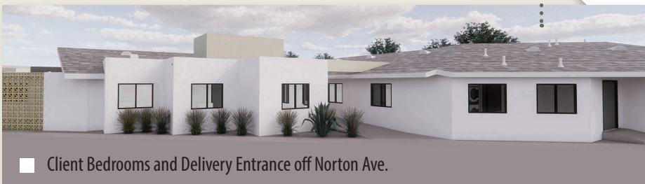
■ Client Bedrooms and Delivery Entrance off Norton Ave.